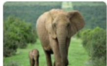
West African Elephants