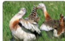
Middle-European Great Bustard